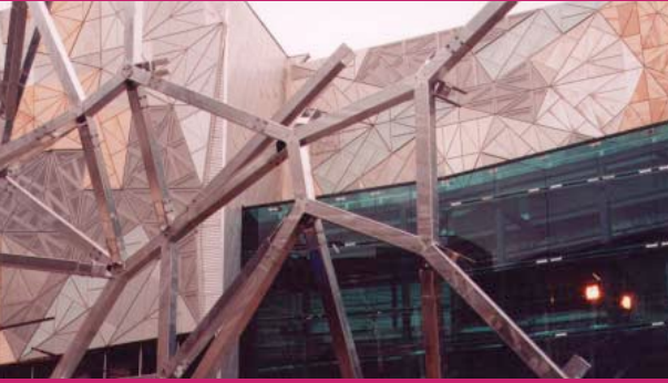
Three main cladding materials have been used