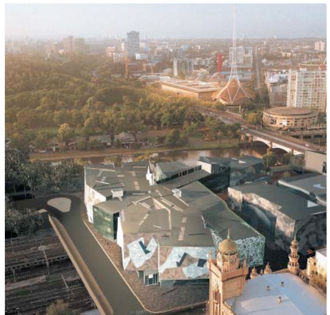
Part of a liveable city

Forming a north-south link from Flinders Street to the Yarra River, the Atrium is a large, high volume public thoroughfare and covered meeting space. This glass-enclosed galleria provides a sheltered extension of the Plaza, and acts as the forecourt to the National Gallery of Victoria: Australian Art. Open at the northern end, the Atrium allows 24-hour access across Federation Square linking the city to the river. The southern half of the Atrium steps down from the elevated level of the riverside promenade, and has been designed to operate as a casual chamber amphitheatre, with an acoustic tuned interior. The open-frame structure of the Atrium has been developed using parts of the same triangular geometry as the facades, but forms a three-dimensional framing system, glazed both inside and outside. The 7,500m 2 Plaza has been designed as the new civic focus for Melbourne, capable of holding about 10,000 people. The Plaza will be paved with sandstone from the Kimberley region of Western Australia, featuring striking reds, maroons, purple and gold surfaces. Federation Square utilises an environmentally sensitive building design. Innovative air-conditioning has been integrated within the building design to achieve significant, long term cost savings. Underneath the Plaza, traditional passive cooling technologies on a large scale eliminate the need for energy-hungry air-conditioning for the glazed Atrium.”